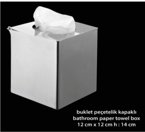
buklet peçetelik kapaklı bathroom paper towel box 12 cm x 12 cm h : 14 cm